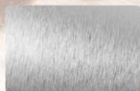
304 stainless steel