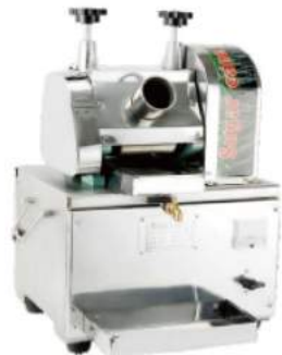
■ Battery Sugarcane Juice Extractor DQ-HD300TD