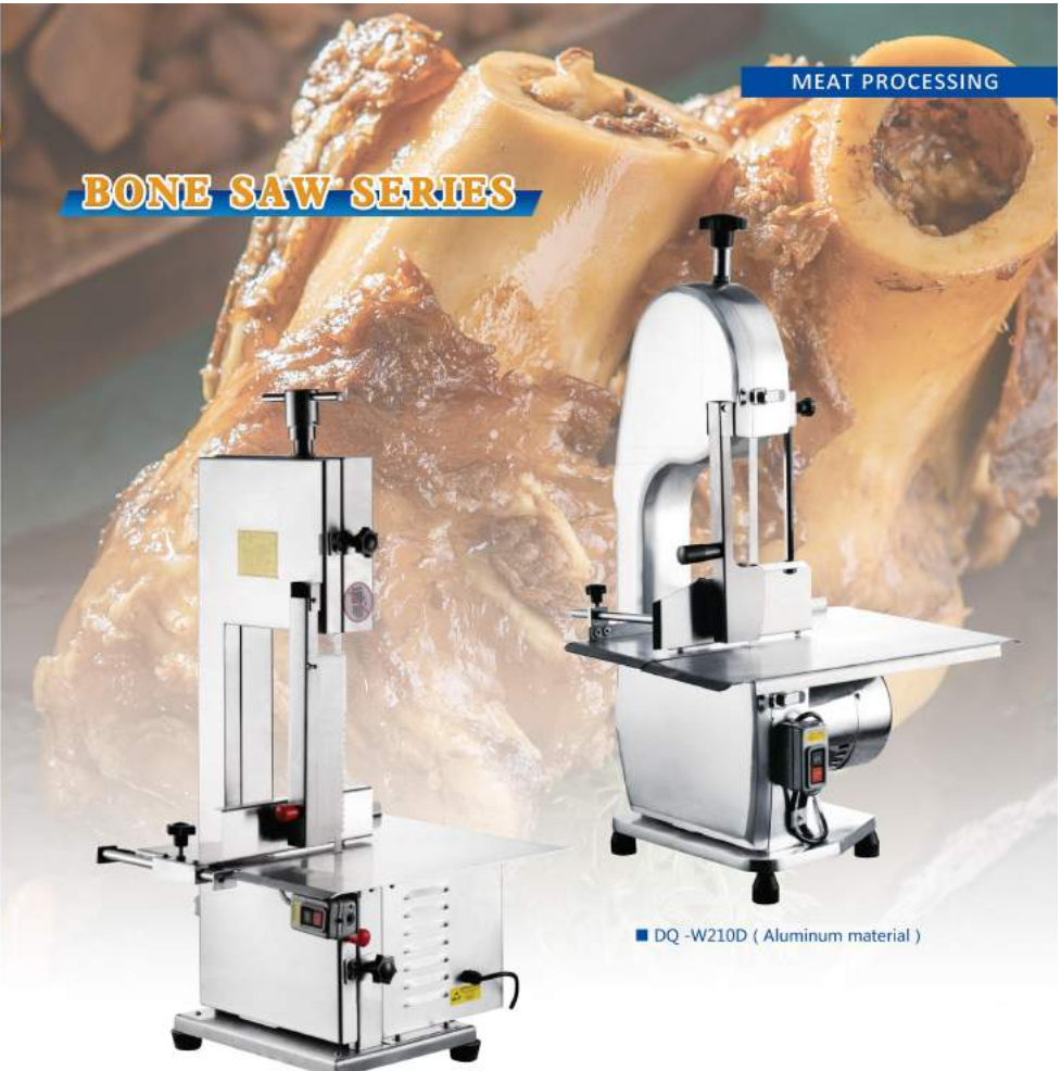
■ DQ -W210CA/W280CA (Steel plate painting)