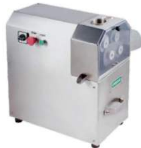
■ Electric sugar cane juicie machine DQ-HDL100