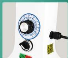
multi-position speed control switch