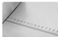
Precise tick marks