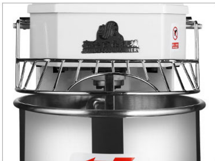
Stainless steel shield