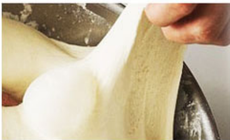
Flour gluten effect