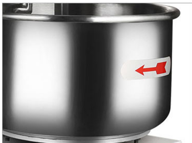
Stainless steel barrel