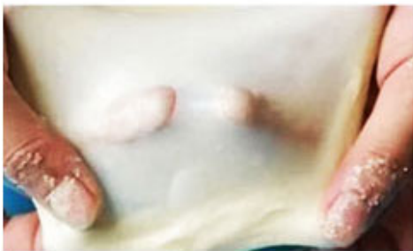
Dough film effect