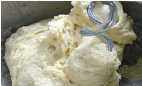
High mixing efficiency

The flour is in contact with the mixer in all directions, greatly improving the efficiency of mixing and making the effect better.