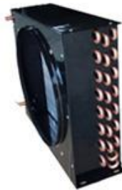
Condenser Two inlet pipe&one outlet pipe Best quality