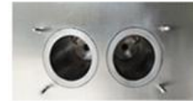
Integrated foam molding Pure 304 stainless steel food grade cylinder