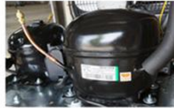
Embraco compressor World famous