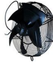
High power fan