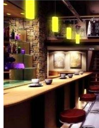
Milk tea shop