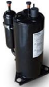
Panasonic compressor International brand