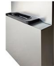
Stainless steel shell High-grade metallic luster